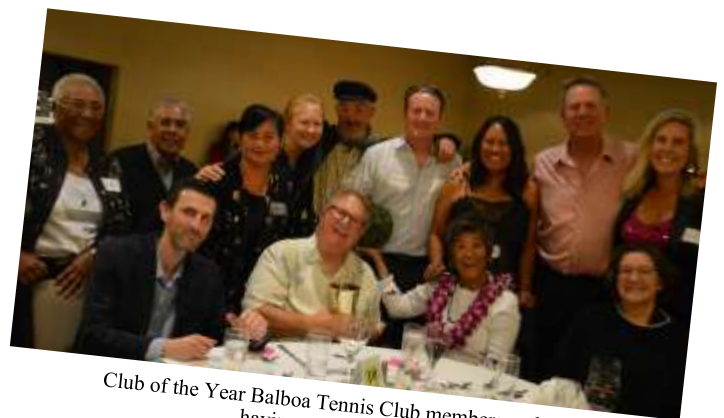
Club of the Year Balboa Tennis Club members and friends having way too much fun!